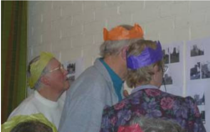
Attempting the church gates quiz!