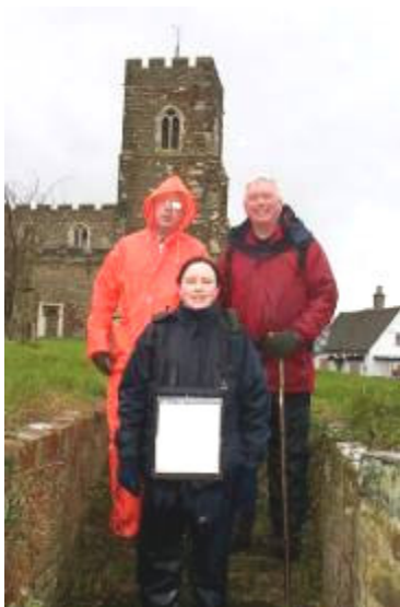
St. John's, Flitton