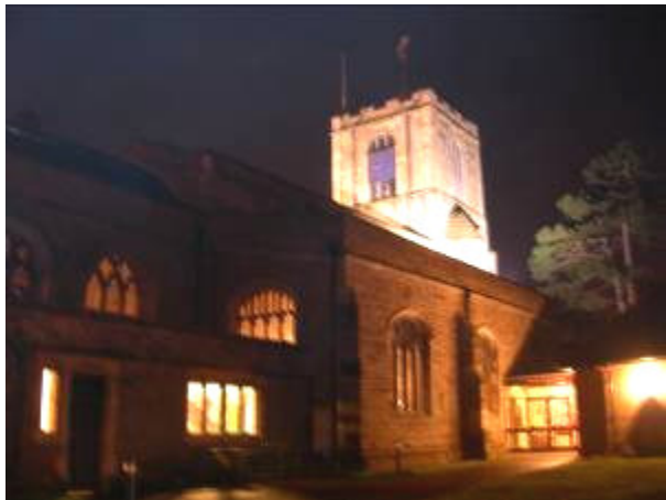
the floodlit church