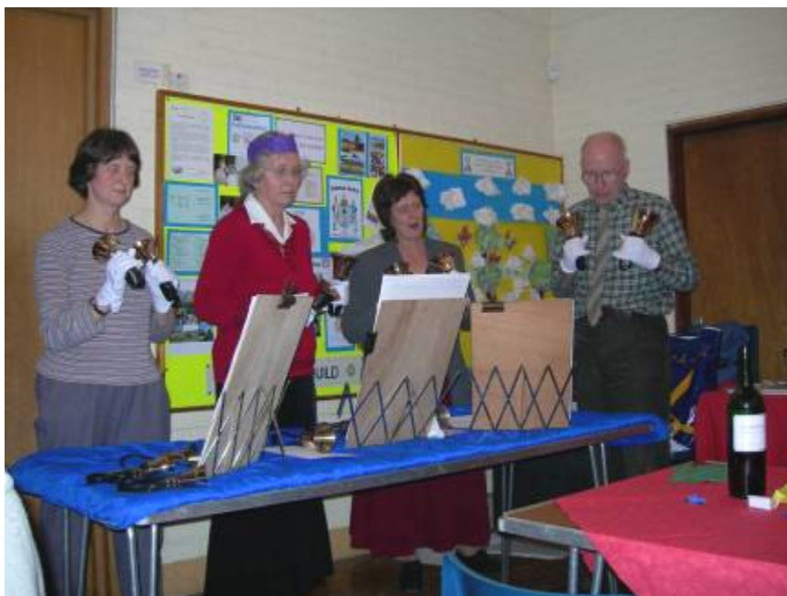
Arlesey handbell ringers

Thanks to all who helped organise this event, particularly those who were involved in preparing and serving the meal.