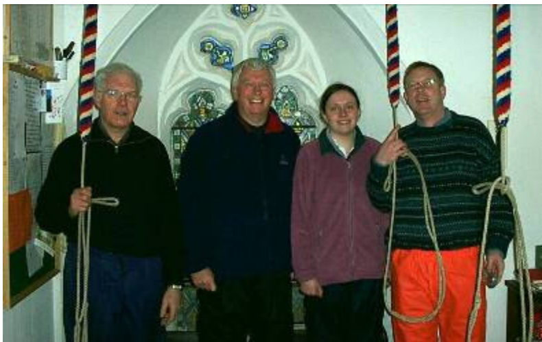
St. Mary's, Maulden