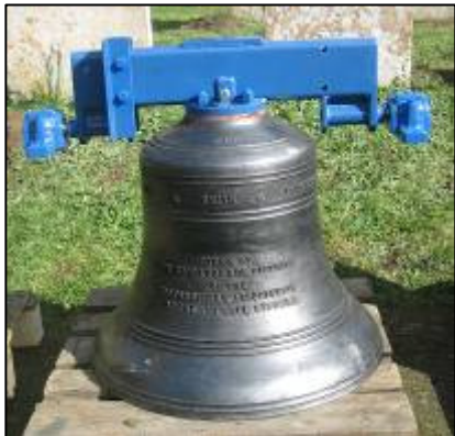
the sixth, given by the Biggleswade District

The new bells, together with their bright blue headstocks, wheels (fantastic to behold for those who've never seen this sort of craftsmanship before) and other fittings close by, generated great interest, as did the inscriptions on their bells. Three of the old bells were on display - these are being kept in the tower as they are historically significant. The notion that these were cast nearly 500 years ago, probably in the churchyard, seemed to capture the imagination of many visitors. People really seemed to respond to it, which is what we'd hoped for. It looks like we have found four recruits as well! We even collected £100 or so through tea/cakes/donations.